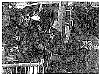
Karting is very popular again now there is somewhere to race