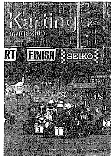
The annual International Kart Prix in Victoria Park was a very prestigious event